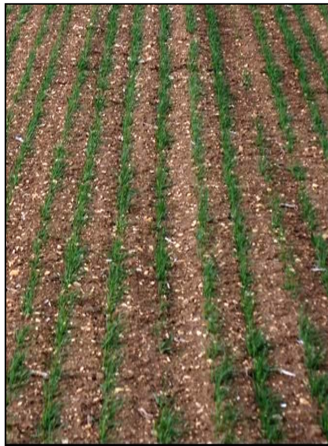
mouldboard ploughing up to 22 cm turning crop residues into soil