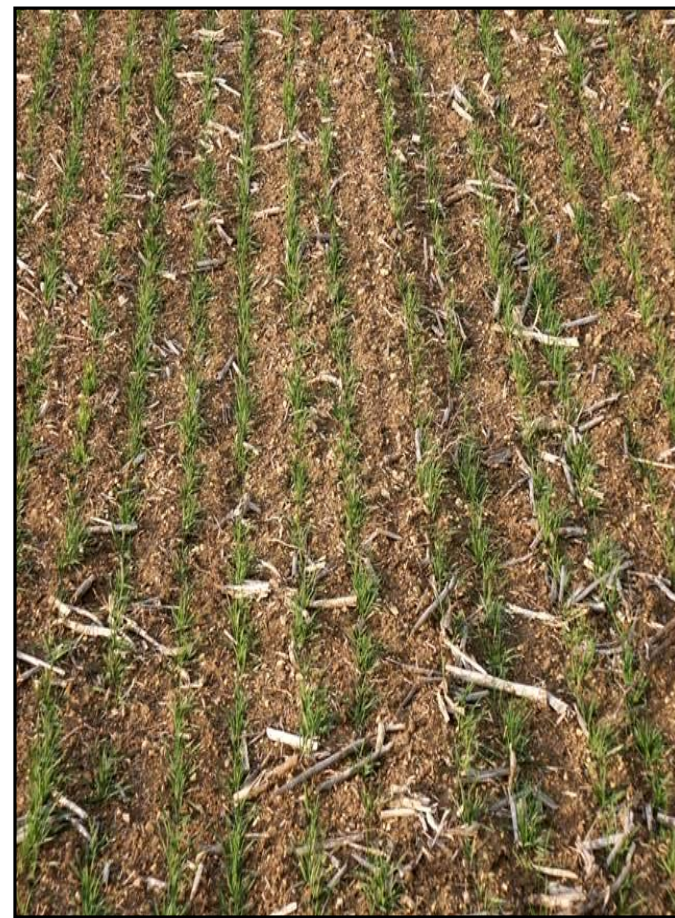
chisel ploughing up to of 10 cm min. 30% of crop residues on surface