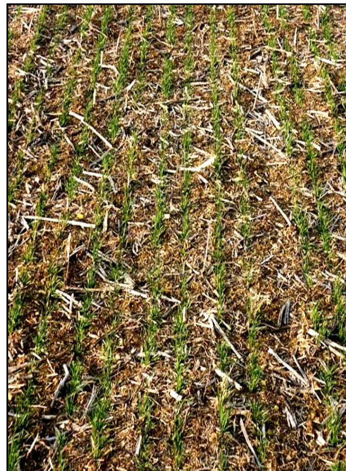
without any treatment all residues on surface