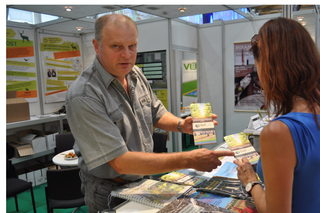
Agricultural trade fair České Budějovice, August, 2017

The SOILCARE project is a 5 year project aimed at identifying and evaluating promising soil improving cropping systems and agronomic techniques increasing profitability and sustainability across scales in Europe.