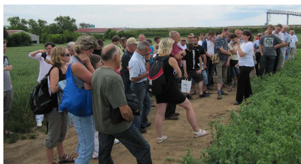
Field briefing (field trials demonstration, discussion; June 7, 2017